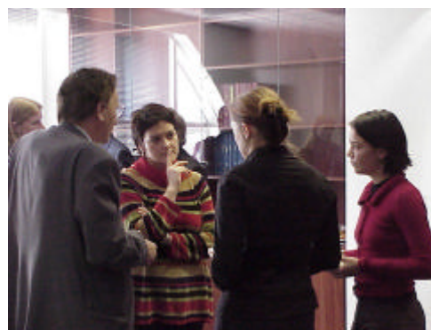
Participants at the joint ISF/ACCORD Energy Seminar